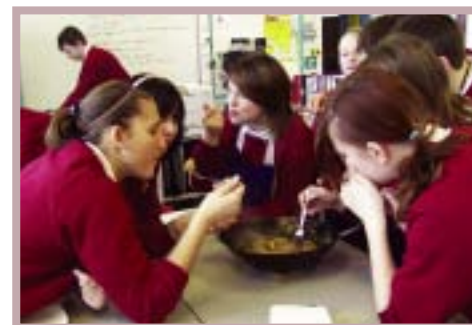
▮ Tasting new dishes.

Students are offered leadership coaching, breakfast clubs and competitions to help them achieve their best in Years 9 and 10. They use these skills in Year 10 to coach Year 9 students for their National Curriculum tests.