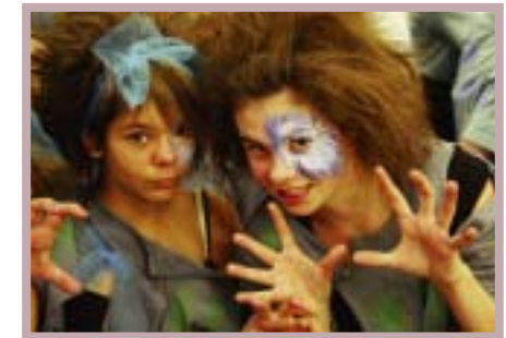
Picnic at Hanging Rock School Production.

E x c e l l e n c e o p e n s a l l d o o r s