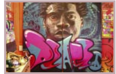
Art is popular in school.

Students are offered the chance to take on extra responsibilities through being Guardians of Excellence (in Years 9 & 10), Prefects (in Year 11) and Sixth Form Counsellors (in Year 12). All these roles develop leadership skills and support other students with everything from their studies to issues which might worry them.