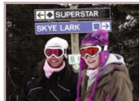
▮ Ski Trip 2009.

E x c e l l e n c e o p e n s a l l d o o r s