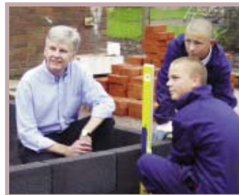
Local M.P. Mr Mike O'Brien visited our Skills Centre.

Our mission is simple and far reaching. We want to help transform this area to become a beacon of excellence in the West Midlands.