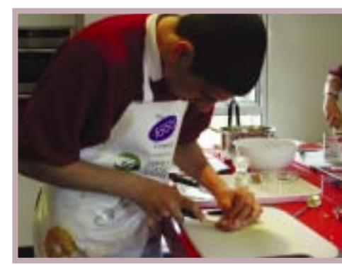
Learning new skills in Food Technology.