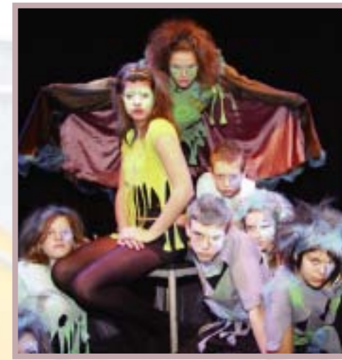
Picnic at Hanging Rock school production.

E x c e l l e n c e o p e n s a l l d o o r s