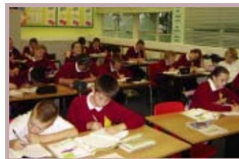
■ Students are taught to respect themselves and their learning environment.

E x c e l l e n c e o p e n s a l l d o o r s