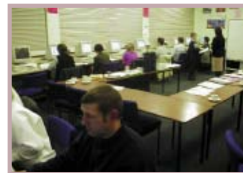
! Technology status offers a variety of learning opportunities.

E x c e l l e n c e o p e n s a l l d o o r s