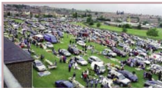
! The Parents' Association Car Boots are a huge success.