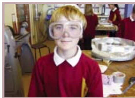
Taking part in Technology Week.

E x c e l l e n c e o p e n s a l l d o o r s