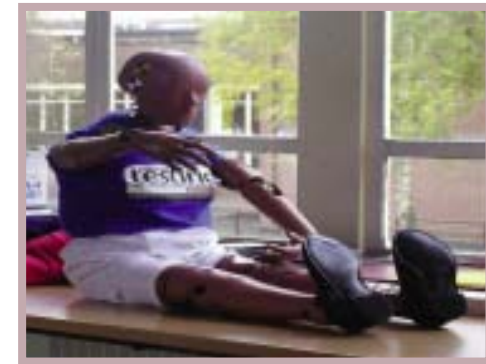
Crash Test Dummy Demonstration.

Every year we hold a major work related learning opportunity for our Year 10 students called Industry Day which is run in collaboration with Warwickshire EBP (Education Business Partnership). We invite in a wide range of business partners who help students successfully complete a variety of enterprise tasks. Students learn how to be resourceful, highly structured and business-minded. We find students grow in confidence and skill level as a result of their work and we are always grateful for the time, guidance and expertise brought to us by our community partners.