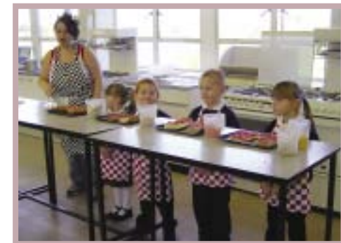
We place great value on our partnership with local schools.

E x c e l l e n c e o p e n s a l l d o o r s