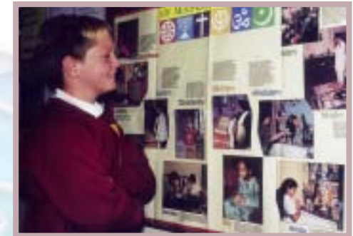
It is important to learn about different faiths and beliefs.

E x c e l l e n c e o p e n s a l l d o o r s