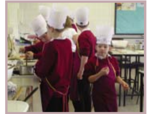
Young chefs busy at work.

We offer all students the opportunity to experience life in the work environment through our comprehensive programme of work experience placements and enterprise days.