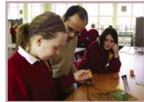
Students working with one of our Industrial Link partners