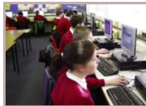
■ We encourage high quality learning skills across all subjects.

The responsibility for meeting the Special Educational Needs of students is shared by all members of staff and the school works collaboratively with the young person, parents and the support services in setting targets and monitoring progress.