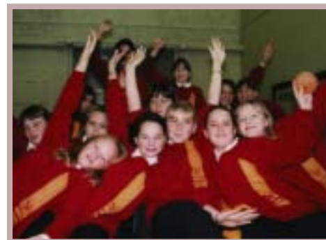
We take pride in our school.