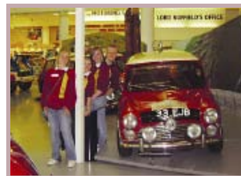
▮ Students recently visited the Heritage Motor Museum.